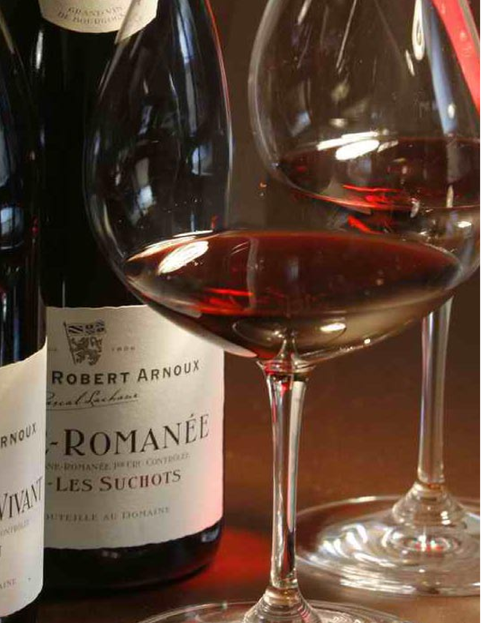
Private Cellar - Burgundy 2008 - En Primeur